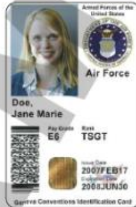
Military ID Card