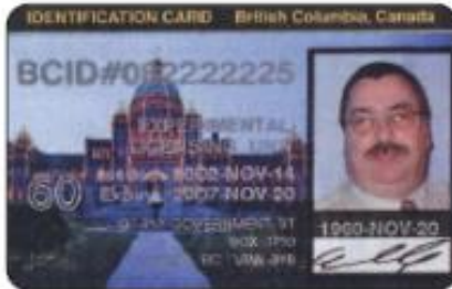
Canadian ID Card (from any Canadian Province)