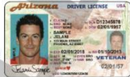
The temporary Arizona driver license or identification card (which is valid for 30 days) contains a photo, date of birth and the basic information that will appear on the actual credential.