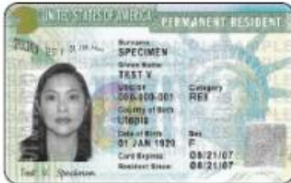
Resident Alien Card