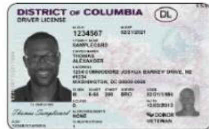
District of Columbia License or ID Card

Permission to reprint this SAMPLE poster is courtesy of: