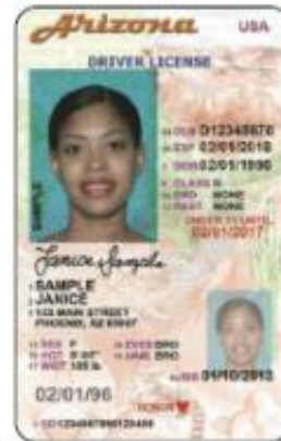
"Under 21" Any Drivers License or ID (Not Valid 30 Days After 21st Birthday) is in vertical format, with driver's image and "UNDER 21 Until" statement to the right.