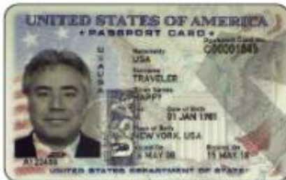
U.S. Passport Card